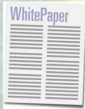
Finalizing White Papers for Education