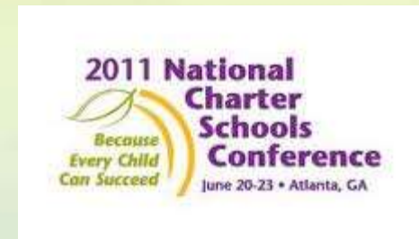
Participated in Panel June 22