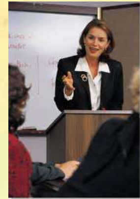
Finalizing Fall Speaking Events