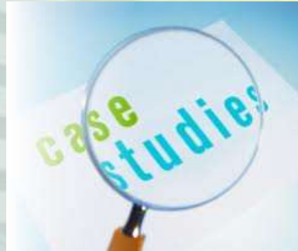
Developing Case Studies